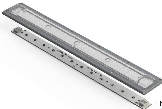
- LEDiL Violet Optic

NewEnergy accelerates the adoption of LED technology through simple, modular products and custom designs. Through 30 years of experience, state of the art manufacturing, full traceability and advanced quality controls, NewEnergy offers leading solid state lighting components, modules and custom solutions. NewEnergy customers get to market faster, with less resources, at lower costs. Visit New-EnergyLLC.com for more information.